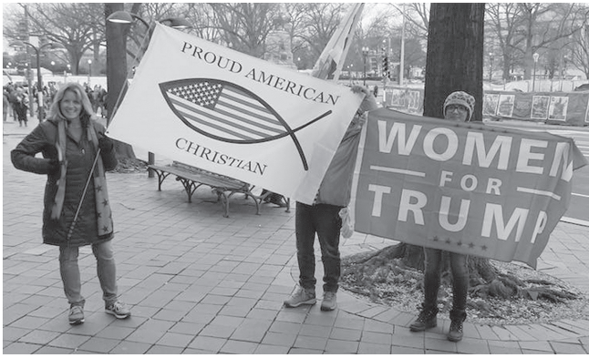
Women display their banners on Jan. 6, 2021.

In the U.S. this is evident in ethnic and holiday parades, museum exhibits, popular demonstrations and highly orchestrated conferences.