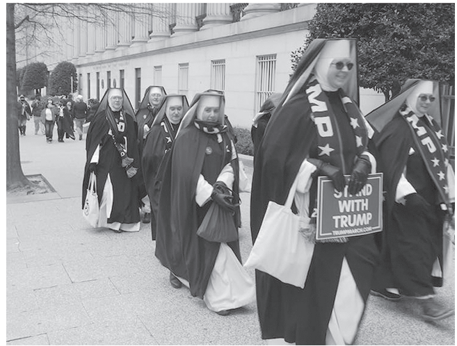
A group of Dominican nuns who supported Donald Trump march in Washington on Jan. 6, 2021.

Despite their professed devotion to God and nation, from the very beginning the Capitol insurrectionists and those at the earlier rallies on January 6 were labeled “extremists.” That term suggests a moral flaw causing people to act in unacceptable ways, such as attacking members of the Capitol police or calling for the vice president to be hanged.